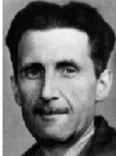
George Orwell 1903-1950